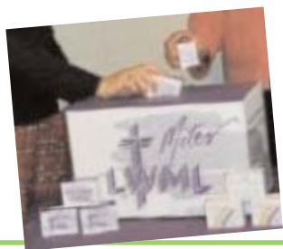
Current Stamp for Missions

Note that Project #2 has been withdrawn as of 2-20-2010