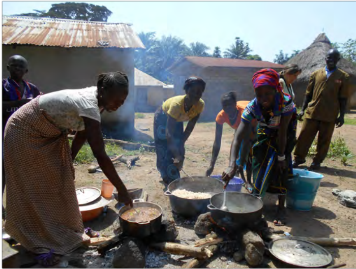
Women of the community cooking our lunch over open fire — no modern conveniences in these villages.

which vehicles can get stuck. On Sunday a 3 hour trip took nearly 7 hours because the truck transporting our luggage and clinic supplies was stuck for nearly 3 hours before it was pulled loose and the mud shoveled going up the hill to allow it to continue on the journey. For a while, we thought we might have to spend the night in our jeep. Going into the mountain villages, means holding on while driving over the uneven rocks which serve as the “road” to the community.